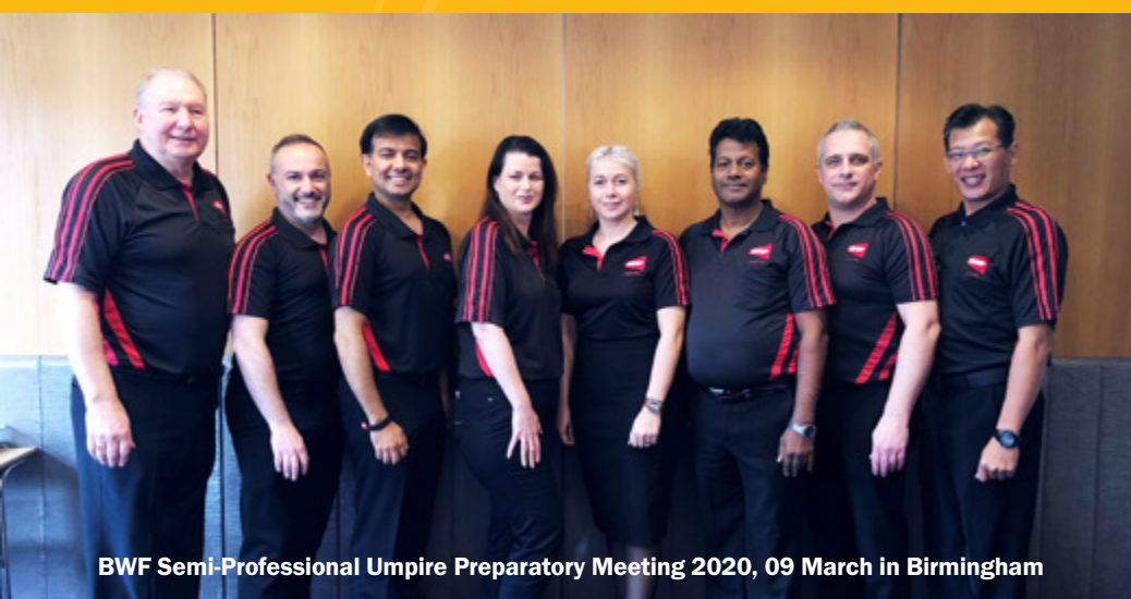
BWF Semi-Professional Umpire Preparatory Meeting 2020, 09 March in Birmingham